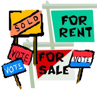
2001 Board Members